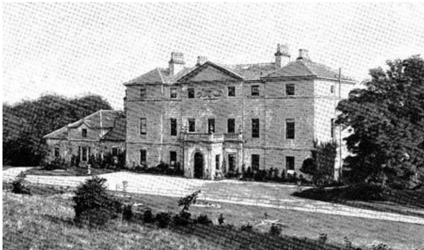
Belleville House in the 1890s

blackmail, but by attacking travelers. His last exploit was the robbery of a carriage, for which his associates were hanged; but the prime offender contrived to escape to America. A cave is shown in the rock where the bandit group used to watch the approach of travelers, and rush down on their unsuspecting prey. [The cave was described in Glimpses 13 - Urlar 98,Wntr 98]