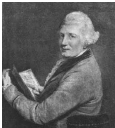
James Macpherson from the portrait by Romney

Tuesday evening, and from the minute he was confined till a very little before he expired, never ceased imploring the divine mercy in the most earnest and pathetic manner. . . . He was a very good-natured man; and now that he had got all his schemes of interest and ambition fulfilled, he seemed to reflect and grow domestic, and showed of late a great inclination to be an indulgent landlord, and very liberal to the poor; of which I could relate various instances, more tender and interesting than flashy or ostentatious. His heart and temper were originally good; his religious principles were, I fear, unfixed and fluctuating. But the primary cause that so much genius, taste, benevolence, and prosperity did not produce or diffuse more happiness, was his living a stranger to the comforts of domestic life. . . . So lived, so died, James Bellavill, for that is the true Highland name of the place. I have been diffuse, perhaps tedious, in what concerns the exit of this extraordinary man, because I thought you might, like me, be anxious to know how people quit the world who have made any noise or figure in it. His death found me sad, and has made me sadder.” 1