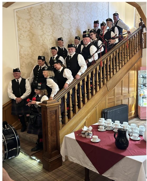
The Pipes and Drums Band from Mt Dora, Florida played for us.