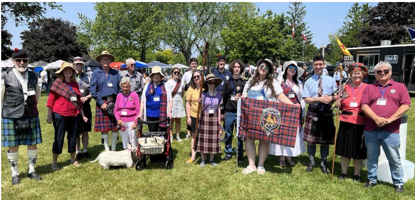
Canadian Branch of Clan Macpherson 72th Canadian Gathering Cobourg , Ontario