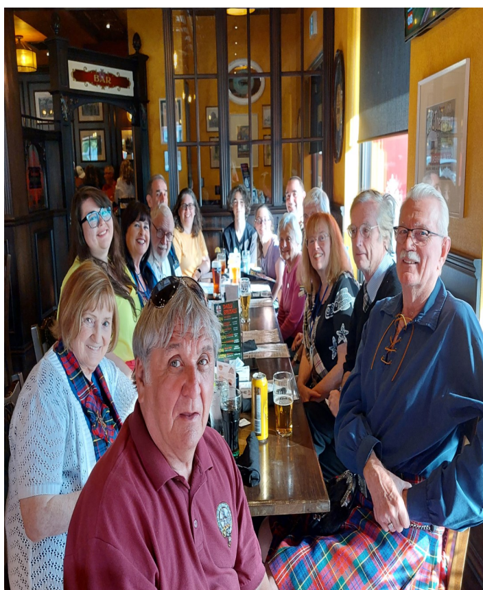
Enjoying our evening meal after a busy day At the Games.