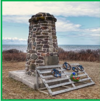
Culloden Memorial, Knoydart

Unfortunately, like many cancellations resulting from the ongoing pandemic, the memorial will not be held this year and has been postponed until 2022. Since writing that last article, I have learned more information about the three Jacobite soldiers commemorated on the memorial at Knoydart.