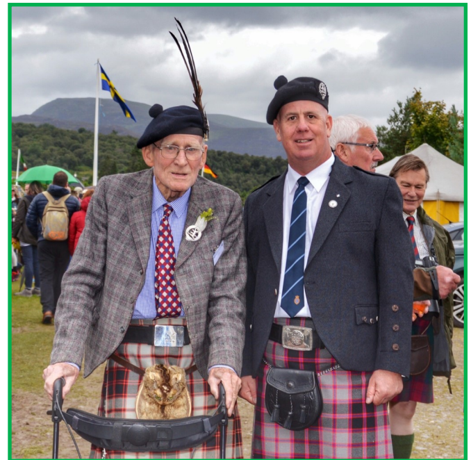
Newtonmore Highland Games, 2016

On March 4th, the New Brunswick Highland Games Festival planning committee made the difficult decision to postpone the games that were to be held this summer in Fredericton. They look forward to having things up and running in 2022.