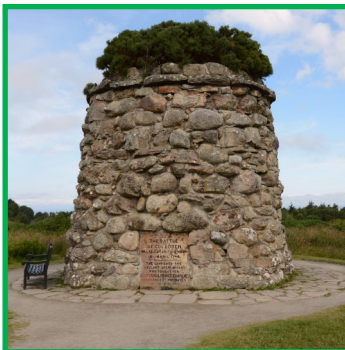
Culloden Monument, Culloden, Scotland

They fought on the battlefield at Culloden, and were imprisoned in Kelso and Edinburgh before being released under the general pardon of 1747.