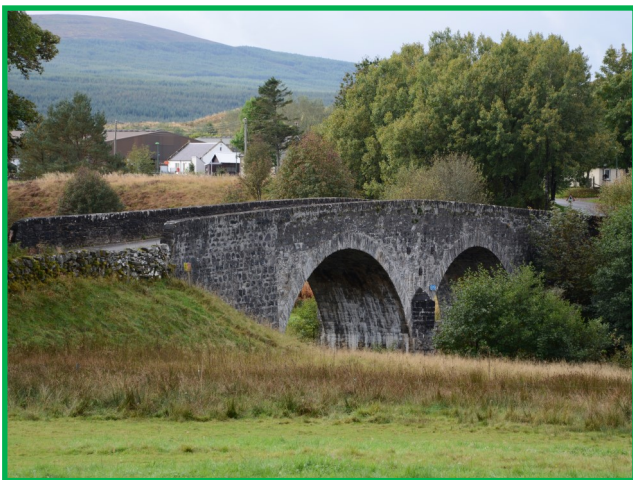
Old stone bridge in the Scottish landscape