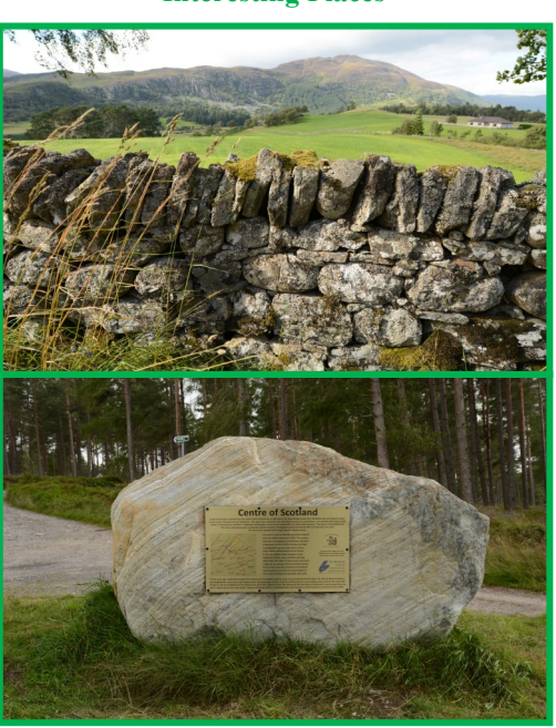
Centre of Scotland —This interesting place near Newtonmore, Scotland is considered to to be the centre of Scotland. The actual spot is indicated by a stone placed in the drystone wall and marked by a carved "X"