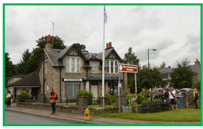
Clan Macpherson Museum

After many years of temporary repairs to the leaky roof the situation at the museum is very bad. Some of the structural members have rotted and unless major repairs are made, we