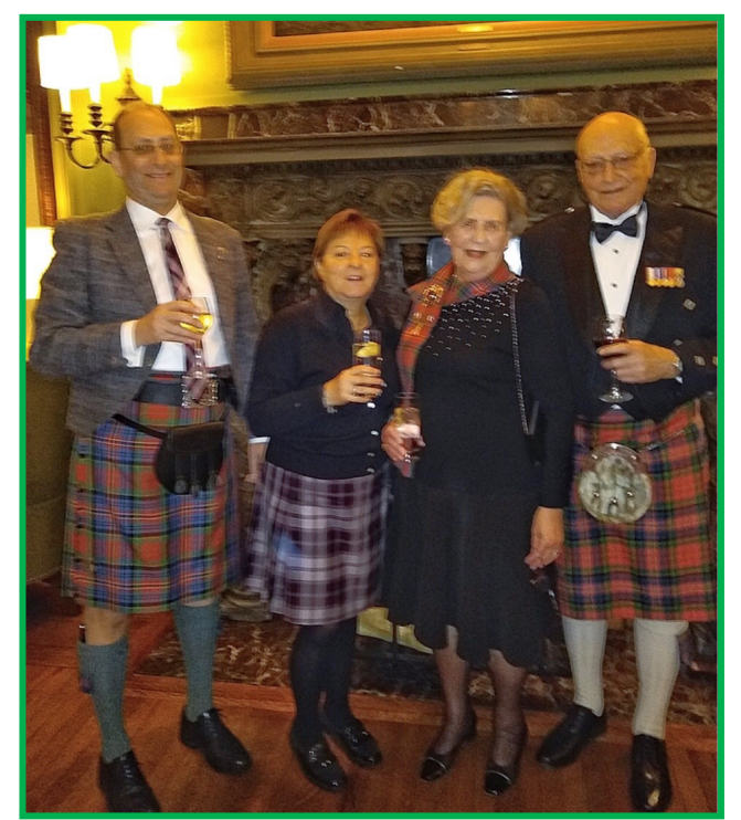
The 2019 Burns Supper in Montreal

looking forward to some interesting Celtic activities coming up over the next months.