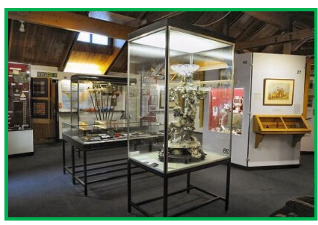
Interior view of the Clan Macpherson Museum

Make a morning of it and meet for breakfast or lunch. If you are not able to run, cycle or walk perhaps you can invite the group for breakfast or lunch at your place (and charge a dona-