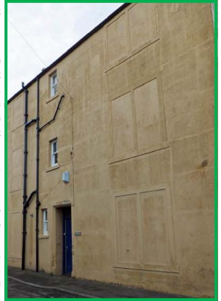
An example of “Daylight Robbery”

Because of the private information that can be gained from the records, the Census office does not release records until 100 years has elapsed; therefore we will have to wait until 2021 before we can learn more. However one can glean a lot about our ancestors over the 70 years between 1841 and 1911. so for those members who are interested in tracing their family roots can benefit from a search through the Scottish census records.