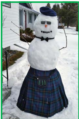
McFrosty greeted the guests

One guest discovered that 15% of Canadians claim Scottish ancestry and that every province in Canada has a tartan so gave us a quiz on which tartan belonged to which province. Another guest brought a quiz on Scottish phrases and two others brought Scottish jokes. If the space hadn’t been limited I’m sure there would’ve been dancing too!