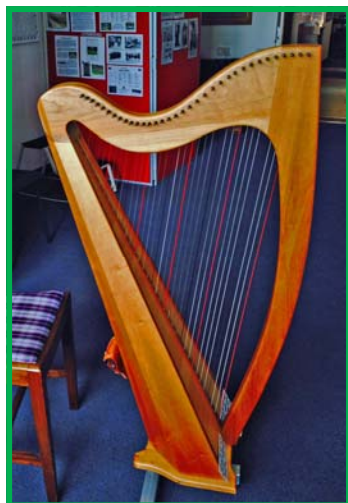
The clarsach at the Clan Museum

When you visit Scotland and Badenoch enjoy the sounds of the clarsach at the Clan Museum, and at the Clan Gathering during the Ceilidh.