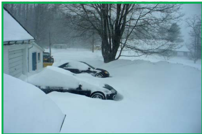
Winter of 2015 in Middleton NS

I attended a Burns night and some St Andrews events this winter. I have been in touch with some prospective members in Nova Scotia who have shown some preliminary interest in joining CMA, which I will follow up. I hope this will be beginning of an increase in membership in the Province.