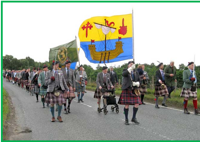
Clan March 2013 Gathering

To be known as the Platinum Dhubh, this milestone in the Association’s history will be celebrated with a unique programme of events taking place in Scotland around the weekend of 5-7 August 2016 , and for some days on either side.