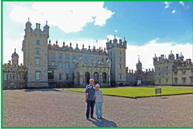
Floors Castle with its many windows

In the late 1690s, the English king was short of money so he introduced the much-despised Window Tax. This was a tax levied on the windows of a property. The upper classes, having the largest houses, paid the most. Some wealthy individuals used their ability to pay as a mark of status and demonstrated their wealth by building homes with many windows.