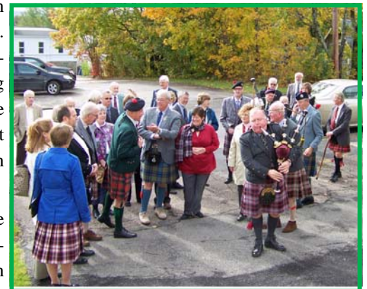
Some of the CMA members before the Sunday church service at Baddeck NS, during the last Joint Gathering held five years ago in 2010

Look for the agenda and registration form in the mail. And we hope to see you all there!