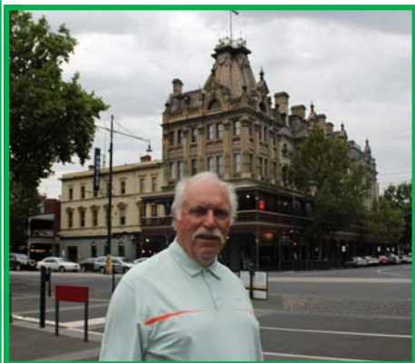
The Shamrock Hotel with its Victorian facade