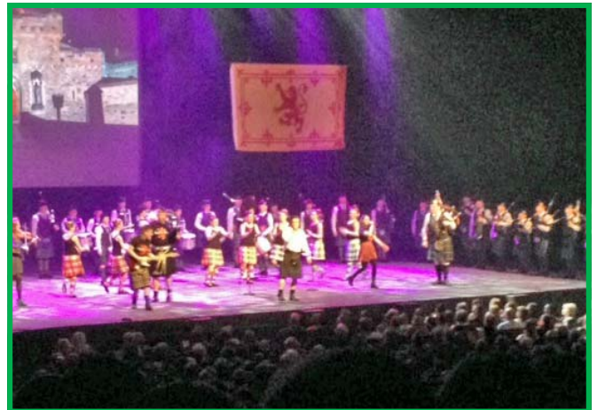
Scottish Tattoo at the Sony Centre Toronto