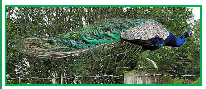
Donna's Peacock getting ready to strike

Jill was driving, and we were on our way to the Glenlivet Estate. The countryside, overgrown with brush, trees, fences, and fence posts, seemed peaceful with late afternoon sun dappling the leaves in the forest. I was minding my own business in the passenger side of the car, reading a map, figuring out our next turn. Suddenly, Jill shouted, "Peacock, Peacock, Peacock!" I dropped my map, looked up, turned my attention to the side of the road next to our car, and there was this gorgeous brilliant peacock standing on the fencepost, in full sleek mode, making ready to dive straight into our car! I took a quick look at Jill, who was ghost-white, gripping the steering wheel, ready for the