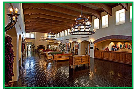
Lobby Hotel Albuquerque

Please call the hotel directly at 505-222-8743 and mention that you are with Clan Macpherson to make your room reservations and receive our special rate