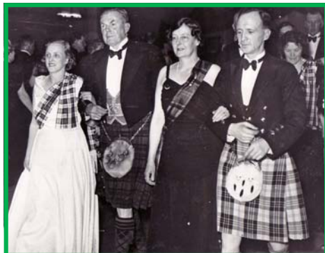
Grand March from a CMA Gathering ball in the 1950's. My mother is on the left in the white gown and my father on the right wearing "the family sporran". The Grand March was a feature of the balls of this period and ended with an eightsome reel

The proceeds from the jumble sales helped fund outings to places of interest to the Clan Macpherson. Buses would be hired, the size of which would be determined by the numbers attending. We would all pile in, carrying our own picnics. Games would be played, we would paddle in a nearby loch and, if there was a piper present, reels would be danced in the heather. Occasionally there would be a Sunday outing with a church service held before the picnic. Whole families would