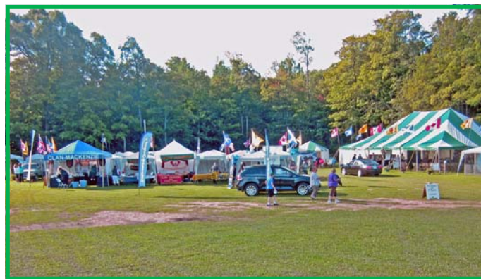
Clan exhibit area at Fergus 2013

Sunday morning there are church parades with a Kirking of the Tartan and those clan representatives that choose to stay and set up again, do so after church - .we did! And a lady with a life membership who had not received a Creag Dhubh since she left her father's home presented herself at the tent to enquire why. At this writing our Registrar is investigating.