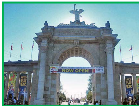
Iconic Prince's Gate to CNE