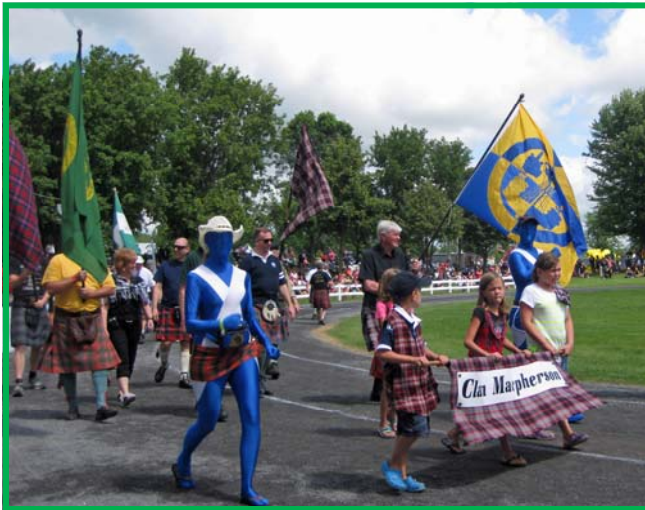
Macpherson contingent on the march.