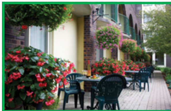
The Courtyard at the Waterloo Inn

Bill will be sending out an email shortly with more details.