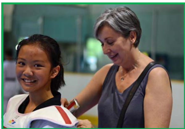
Installing a wireless transmitter in a young contestant's equipment

This system was featured at the 2012 Olympics in London. It uses wireless technology to allow athletes to score points by wearing E-Foot gloves that have rare earth magnets and also chest protectors with transmitters that communicate to a base station that measure speed & impact of kicks. Head shots, punches and technical bonus points are scored by judges that use a set of wireless triggers.