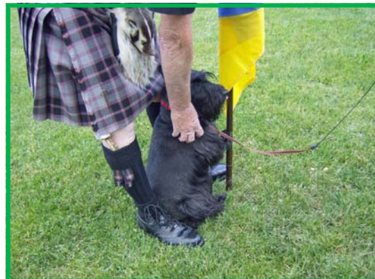
McDuff being unwrapped from the staff of the Association banner

The Macpherson tent was busy most of the day and the weather just got better as the day progressed. We had one membership renewal. Sales were slow although there was considerable interest in Clan Macpherson displayed by the visitors. At the end of the day thirty-seven pipe bands assembled for a thrilling and spine tingling massed bands display.