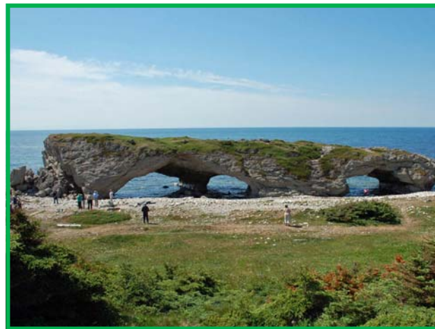
The Arches on the Viking Trail

We crossed the Straits of Belle Isle on a ferry to Labrador, where we visited Red Bay which was a whaling station for the Basques people in the early 1500's. Then it was back to Newfoundland by ferry where the tour headed south along