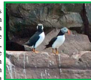
The puffins at Witless Bay

We headed east to Grand Falls where we saw Atlantic salmon making their way up a fish ladder to get by the falls. The tour, amongst other places, stopped at Bonavista, where John Cabot made landfall in 1497. We traveled the Avalon Peninsula where we took a boat trip out to the Witless Bay Ecological Reserve and saw our first puffins.