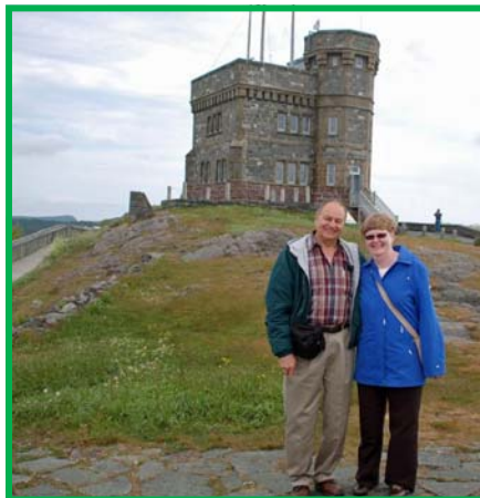
The Honorary Newfies at the Cabot Tower on Signal Hill

The most eastern point of North America, Cape Spear, is our last stop before entering St John's, the oldest city in North America. It has interesting places such as Signal Hill, which includes Cabot Tower where Marconi received the first transatlantic radio signal in 1901, and its famous