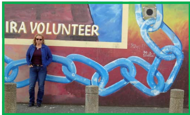
A rebel from Toronto in Belfast

I ran a practice 9k in Derry. The river Foyle is paved for pedestrians and bicyclists alike. And one can run both sides of the river. I laughed when one woman was huddled in her coat and scarf walking across the bridge, saw me run up the bridge and down the bridge. She thought it was cold and that I was crazy. Derry is amazing. It's the only walled city left in Ireland. And it's wonderful.