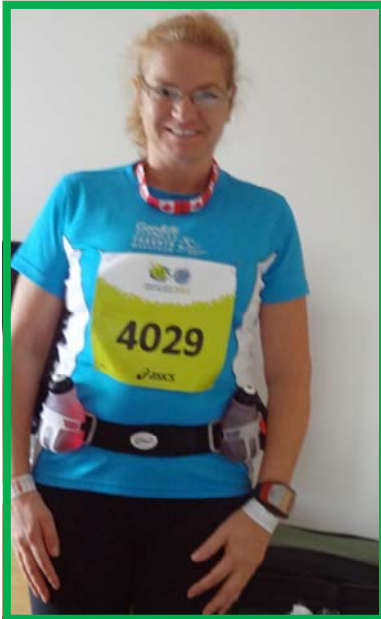
Ready to run