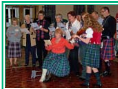
The intrepid choir