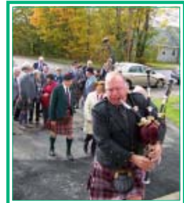
Rally being piped into Knox Church