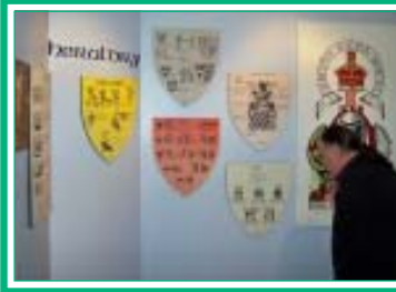
Gaelic College museum heraldry exhibit