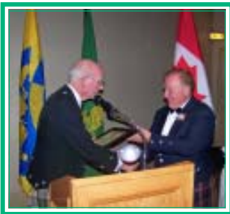
Clan Piper presentation