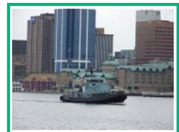
View of Halifax Harbour