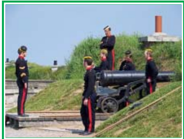
Gun drill at the Halifax Citadel

With our free time we did the usual tourist things. We visited the Citadel, a national historic site, the last of four forts which were built there to protect Halifax. It has a wonderful museum and each day is marked by the firing of the noon gun. Tours of various lengths are available. The Halifax Public Garden is an absolute delight. It is a perfect place for taking photos. There is a small jewel of an Art Gallery as well as a Maritime Museum. Along the harbour front you can find Privateers Wharf and Passage, restored historic properties, which now contain shops so that you can shop til you drop. as well as a dinner cruise. However we had to forego that last treat as our time was limited; but we plan to include it when we travel to the rally in the fall. For those who are interested and have the time there are whale watching cruises as well. I advise all who are interested to go to the web to research the various attractions or contact the Provincial Tourist