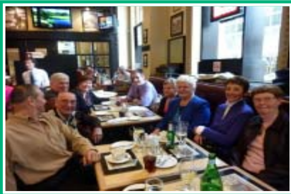
CMA Toronto members enjoying the first meet and greet

Saturday afternoon April 23 nearly a dozen CMA members got together at the Irish Embassy Pub & Grill in Toronto to chat, laugh and exchange information on what has been going on in each other's lives. It was truly a remarkable afternoon allowing us to meet some new friends while old friends could catch up with each other. I know that a number of members in the area had to cancel at the last minute, or were not able to make the appointed time. Rest assured, we'll continue to offer up these afternoons so we can continue to meet. After all, our common connection is why we're members and have become friends.