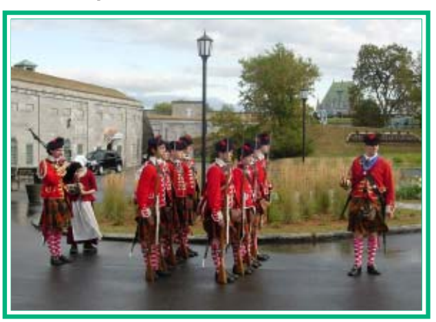
A group of Fraser Highlanders on parade before the ceremony at the Citadel