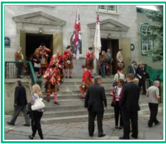
St Andrews Presbyterian Church Quebec- after the combined CMA 78th Fraser service on Sunday