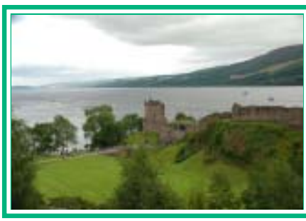
Castle Urquhart with Loch Ness in the backgound as viewed during our drive north from the rally in Newtonmore

Never having been north of Inverness on previous trips, after leaving Badenoch, we headed up to Wick, John o'Groats and on to Orkney. The archeological sites on