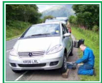
Professional repairs on Route A85, Scotland 2008