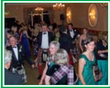
Highland Ball in full swing