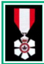
Order of Canada Medal for Member

The Order of Canada was instituted by Queen Elizabeth in 1967, Canada's centennial year, as the highest honour that could be awarded to Canadian Citizens for outstanding contributions to the country. Recipients are entitled to wear a lapel pin in the form of a small replica of the medal and to use the postnominal CM.