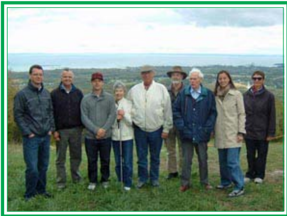
The hardy hikers on the top of the Blue Mountains with Georgian Bay in the background