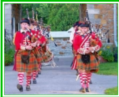
Pipes and drums of the 78th Frasers at Fort St Helen Montréal

When Simon Fraser, Master of Lovat, and Chief of Clan Fraser, was asked to raise a regiment in the Highlands for service in Canada he did so with the help of his “gentlemen friends”. His sister, Janet, had married