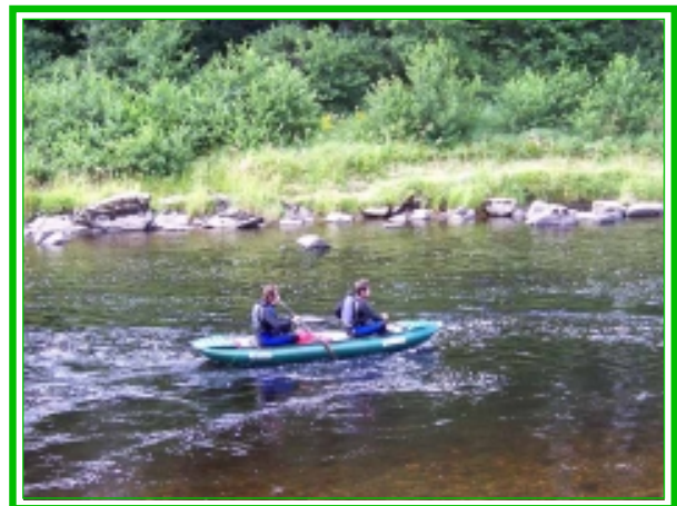
Kayaking near Grantown on Spey