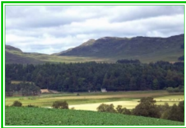
Badenoch near Cluny Castle