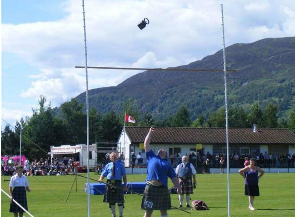
Newtonmore Games and famous Creag Dhubh hill race will miss 2020